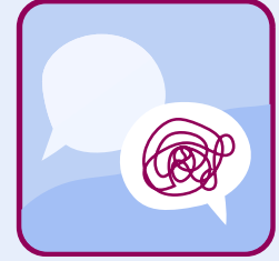
TROUBLE IN CONVERSATIONS