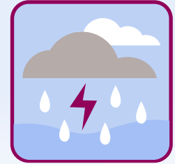
CHANGES IN MOOD