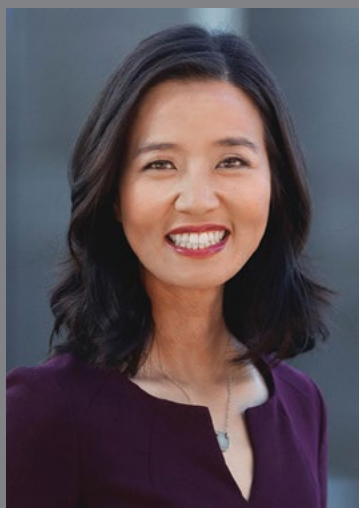
Michelle Wu Mayor of Boston

Michelle Wu is the first woman and first person of color to be elected Mayor of Boston. The daughter of Taiwanese immigrants, she serves as a dedicated caregiver to her own mother at home. Mayor Wu has been a steadfast collaborator, working in partnership with Ethos to further care,