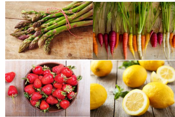
Photos from USDA Spring Produce Website

As for Earth Day tips, consider using reusable bags and utensils to decrease the amount of waste at home.